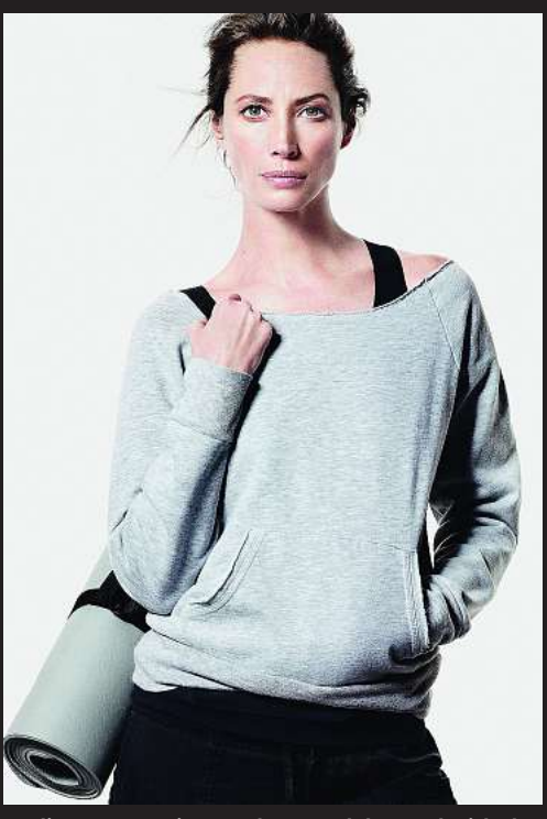
Turlington sporting tracks, a tank layered with the Krishna Top and a Yoga mat from the Esprit Wellness collection.

■ Price starts from RM69.90. The Wellness collection is available at all Esprit outlets nationwide.