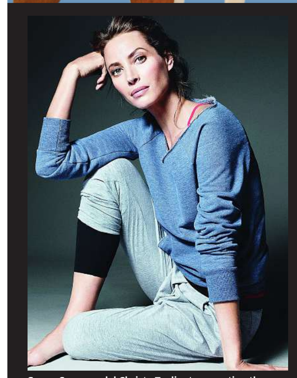
Snug: Supermodel Christy Turlington sporting the Krishna top and Flow Pants from the Esprit Wellness collection.